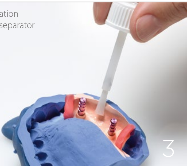
Application of the separator