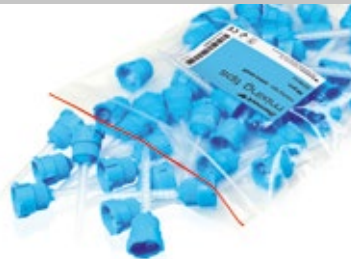
Blue mixing tips (48 pcs)

Find out more about related Zhermack products for gingival reproduction