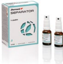
2 x 10 ml Gingifast Separator