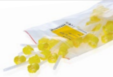
Yellow mixing tips (48 pcs)