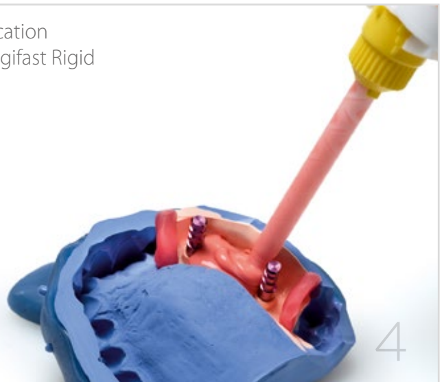
Application of Gingifast Rigid