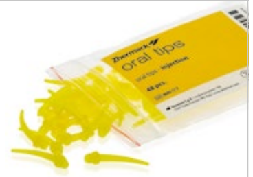
Yellow intraoral tips (48 pcs)