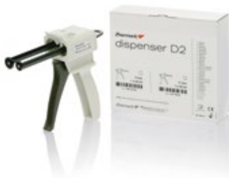
Dispenser D2 – 1:1